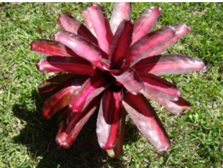
5. Neoregelia 'PINK ON BLACK'