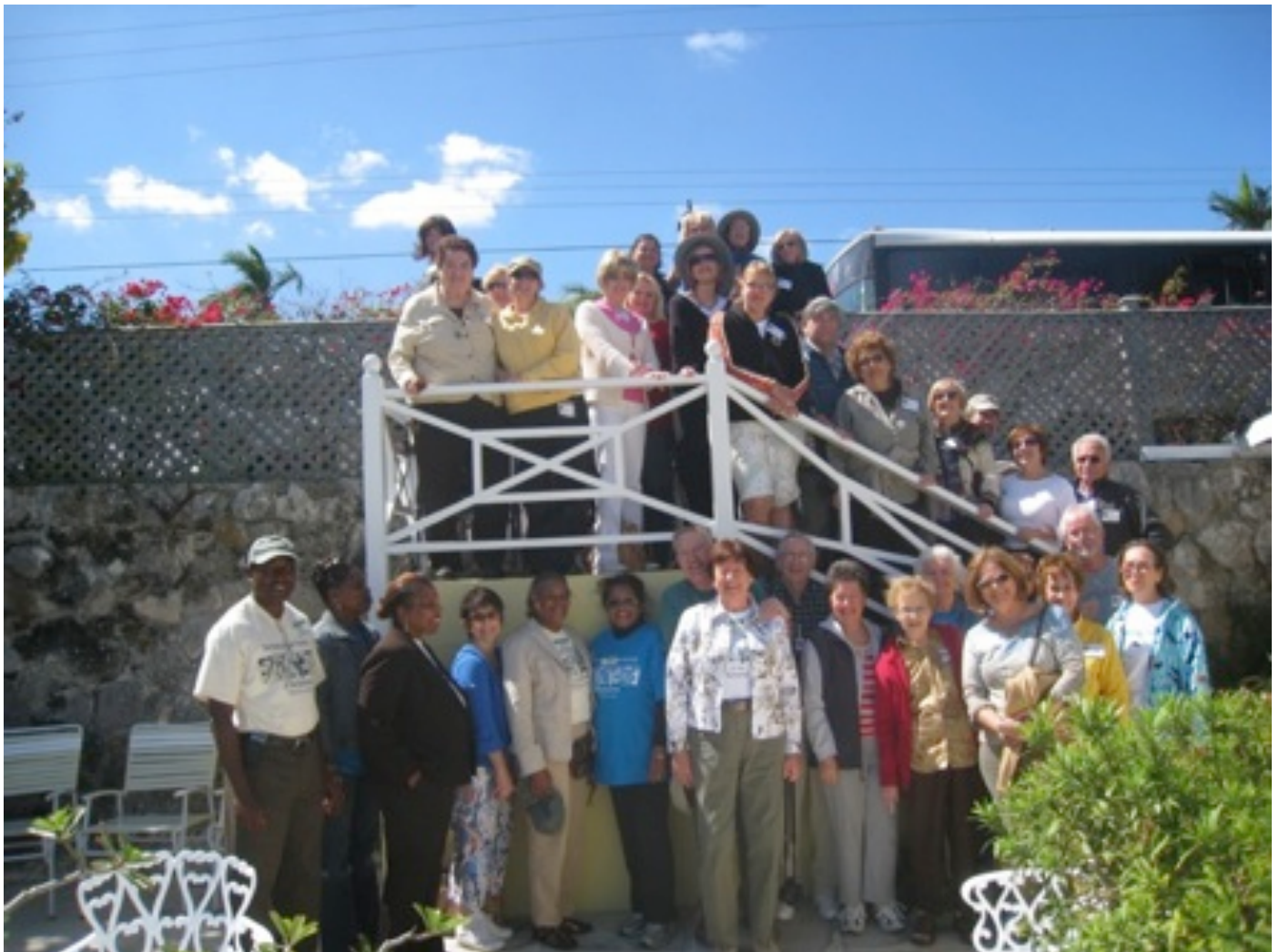
The trip to the Bahama's

Please bring your checkbook so you can continue receiving the SCURF $20.00 per year for Single memberships. $25.00 per year for more than one person at the same address.