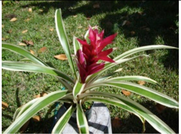
2. Guzmania 'AMARANTH' VARIEGATA