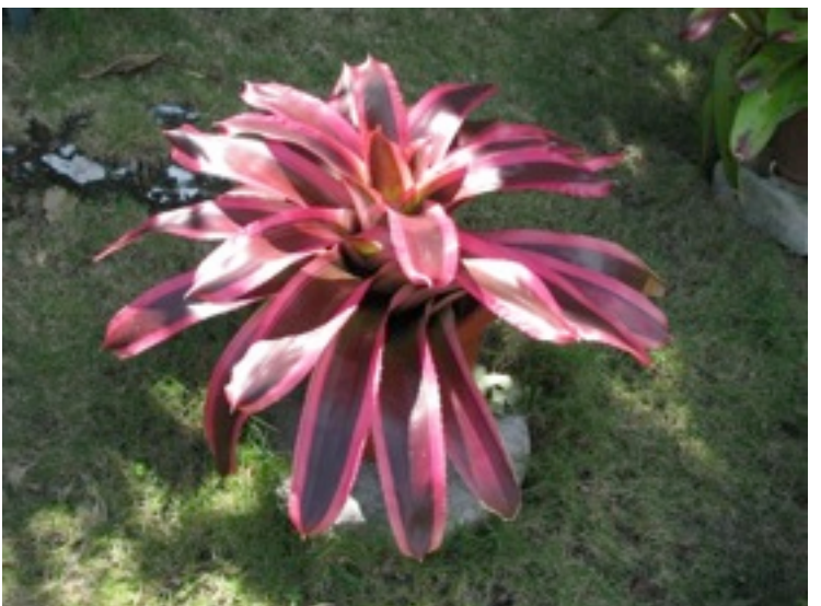
Neoregelia 'CHESTER'