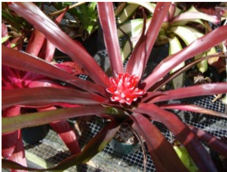
3. Aechmea nidularioides