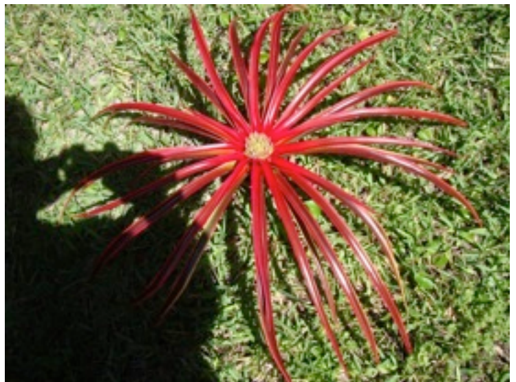
4. Neophytum 'GALACTIC WARRIOR'