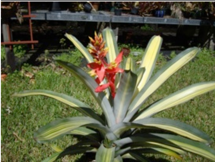
1. Aechmea 'LOIS PRIDE'