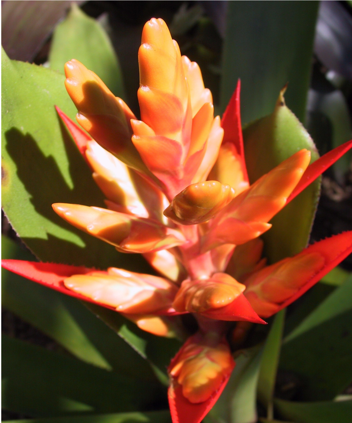
Aechmea inflorescence in Bud Hendrix's Garden.