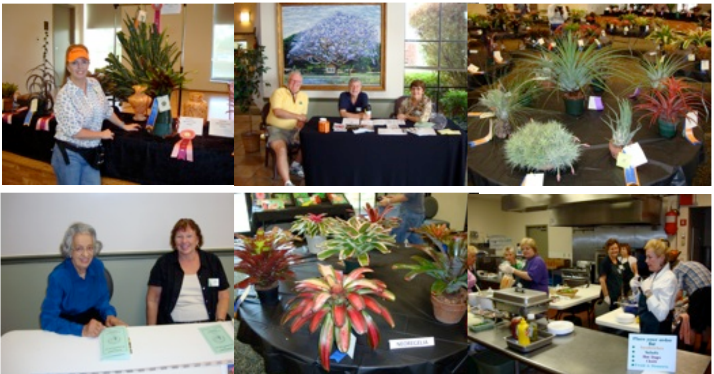
Scenes from the show.