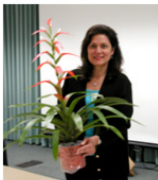
Auction Plant Winner A GUZMÁNIA vittmarckii