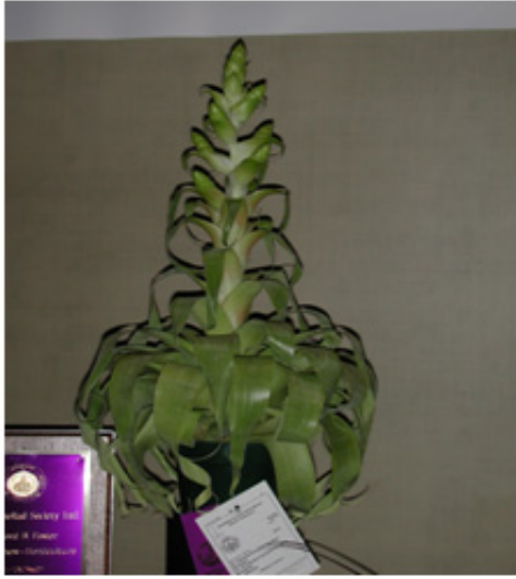
Best in Show Tillandsia coriacea

On the next few pages will be selected pictures from the World Conference in Chicago. Pepe was kind enough to take these pictures for us, since we were unable to attend.