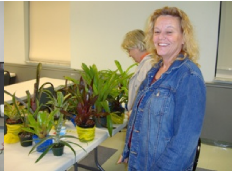
A very happy lady!