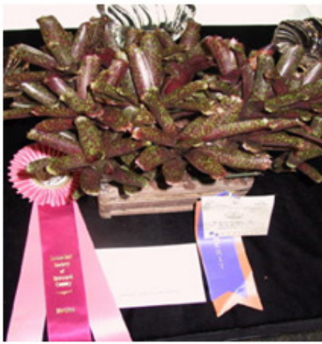
Division 3 Winner Mo' Pepper Please

Winners , Judges, Chairman and member plant sales