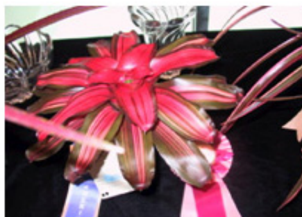
Division 1 Winner Red Blush