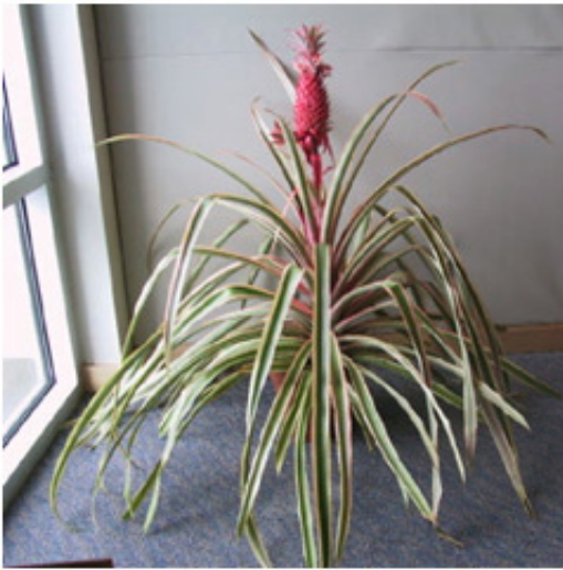
Novice Division Winner