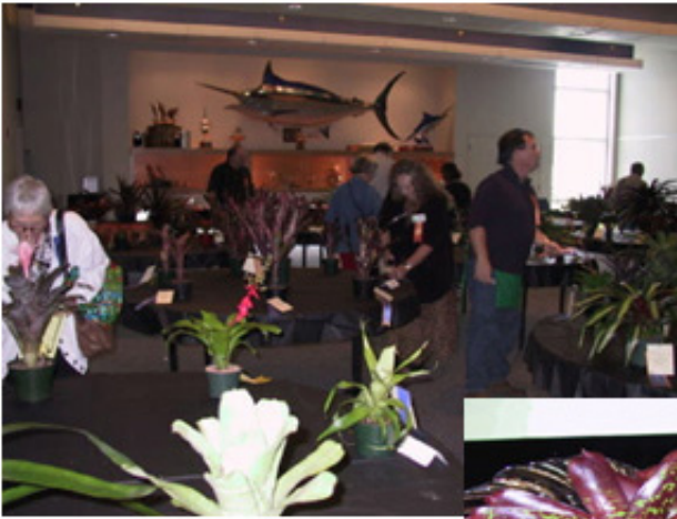
Division 2 section blooming winner Neo Tristis Marmorata x Fireball