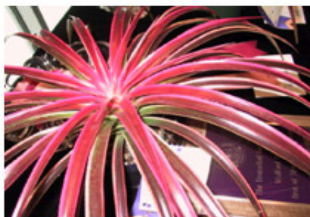
Best in show Galactic Warrior