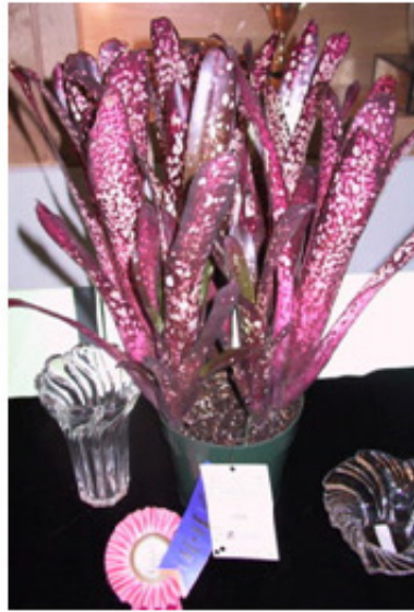
Division 2 Winner Hallelujah

Winners , Judges, Chairman and member plant sales