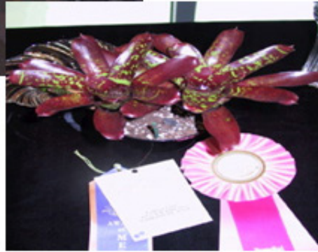
Division 2 section winner