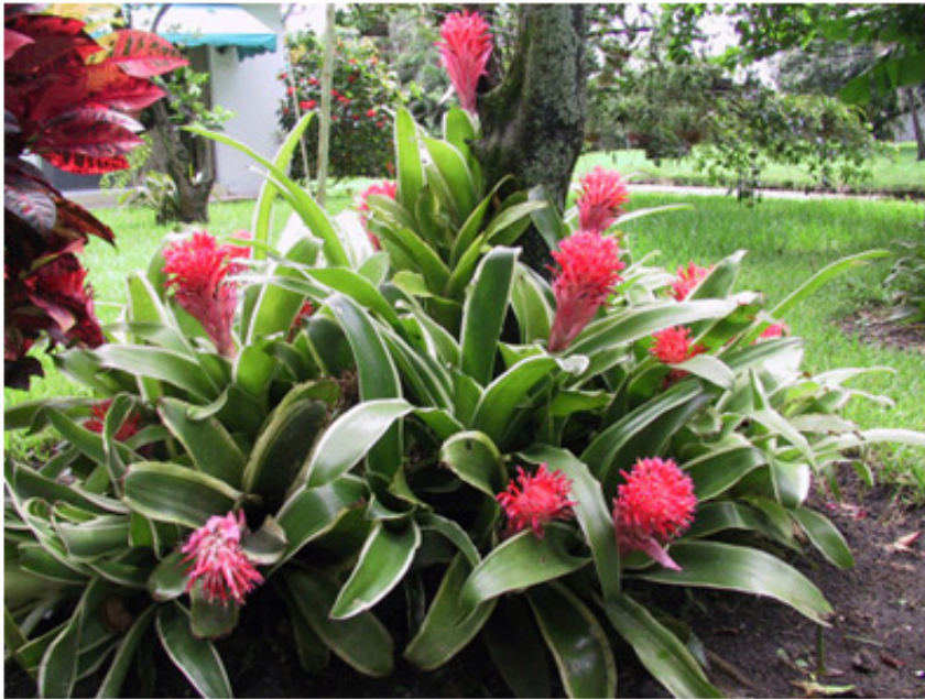
At the home of Ann Schandlemeyer Billbergia kyoto

In the next three months, the potting mix is warmed up, soil bacteria die and break down in increased numbers making the fertilizer (their decomposing bodies) readily available to the Neoregelias. (Keep in mind the initial build up of bacteria reduces nitrogen as it is tied up within the bodies of the increasing number of soil bacteria.) This increased availability of fertilizer is then used by the Neoregelia to finish the growth of the existing leaves and finish off the flower