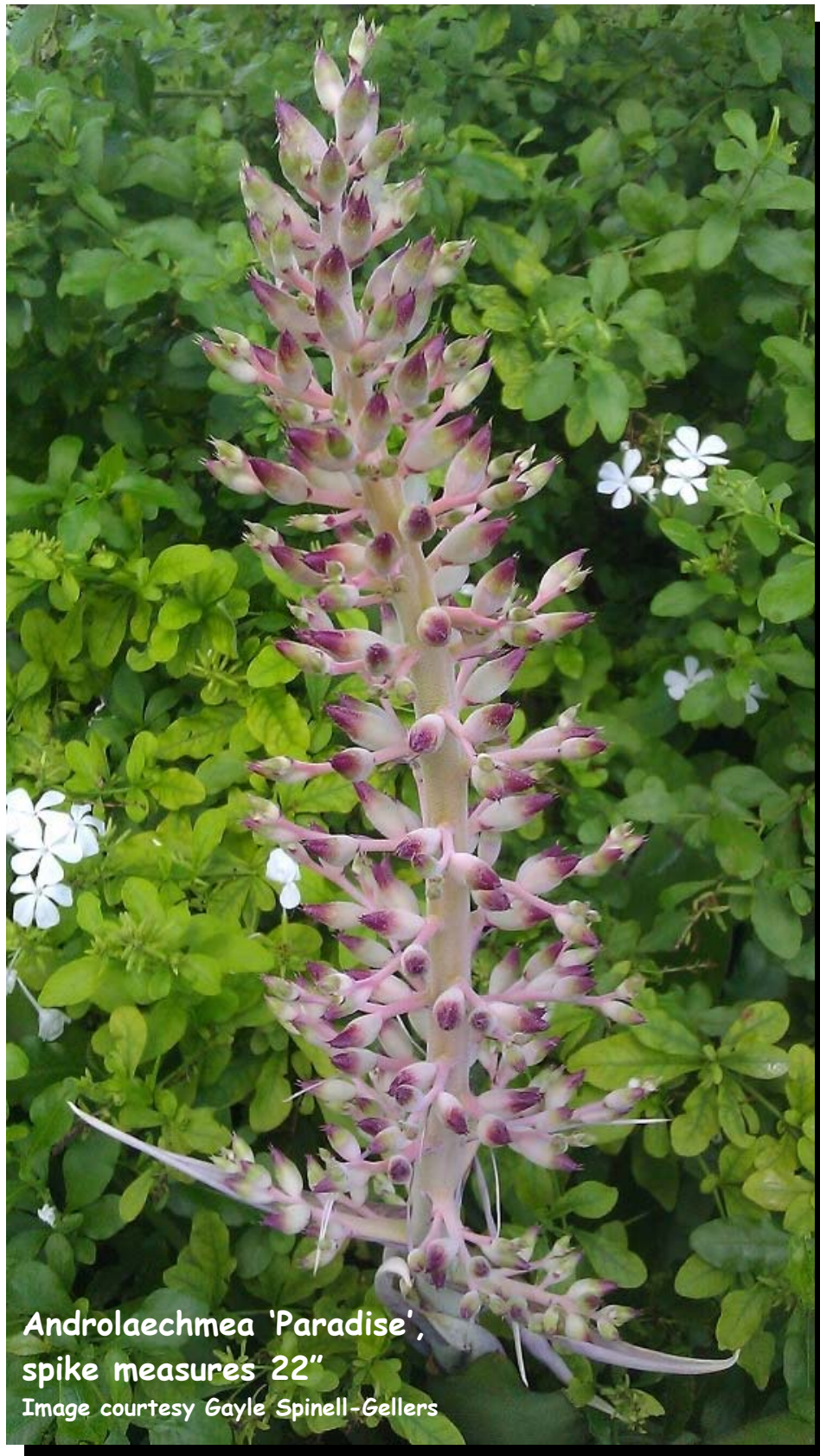
Androlaechmea 'Paradise', spike measures 22"