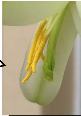
Close up of the stamen and pistil of the flower.